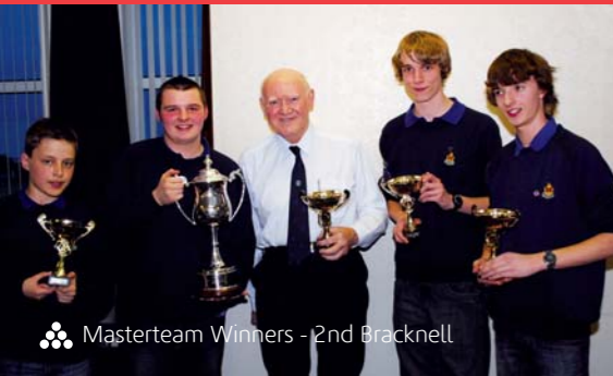
Masterteam Winners - 2nd Bracknell