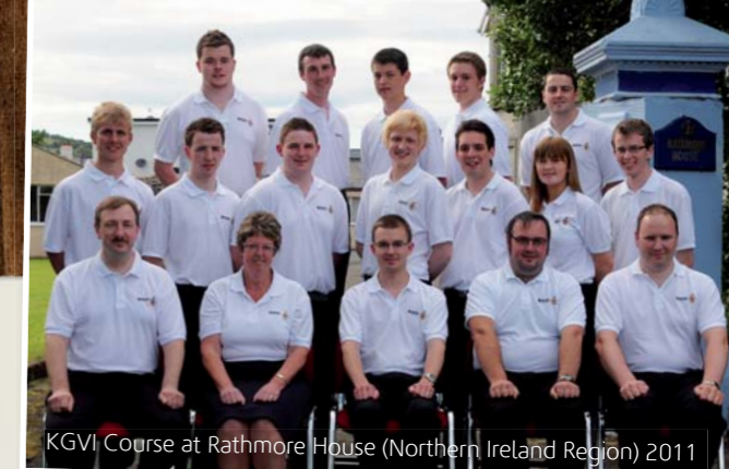
KGVI Course at Rathmore House (Northern Ireland Region) 2011

Each year around 50 young people commit to further leadership within the BB by attending the King George VI Scheme held at Felden (England), Carronvale (Scotland) and Rathmore (Northern Ireland). Here one young man reflects on his time in the BB and why he wants to continue to serve.