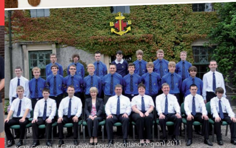
KGVI Course at Carronvale House (Scotland Region) 2011

I joined BB at the age of four. At the time I really didn't know what was going on, I'd just begun Primary School and this was yet another new thing that terrified me. I vaguely remember my first night, but one thing that still sticks with