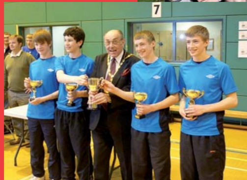
Junior 5-A-Side Winners - 1st Ardstraw