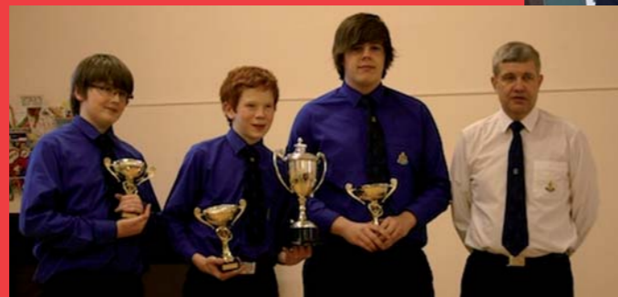
Table Tennis Final Winners 44th Glasgow