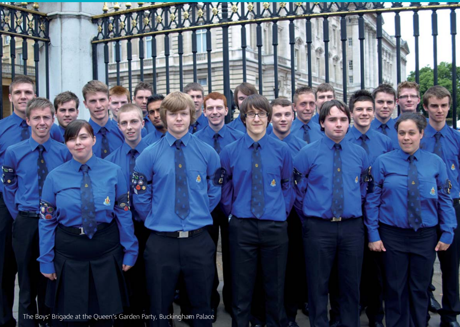
The Boys' Brigade at the Queen's Garden Party, Buckingham Palace

The Boys' Brigade continues to play a significant role in the mission and outreach of 1500 churches throughout the British Isles. Each week dedicated adult volunteers work with over 50,000 children and young people building positive relationships seeking to share the Gospel in a relevant and meaningful way.